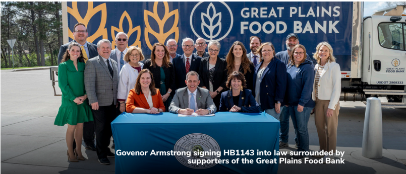
Governor Armstrong signing HB1143 into law surrounded by supporters of the Great Plains Food Bank