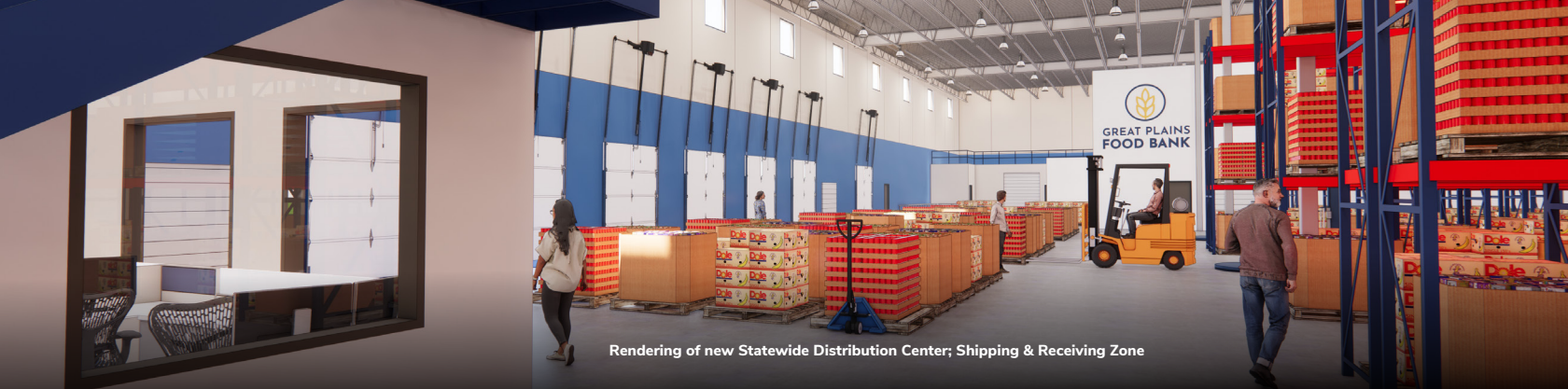
Rendering of new Statewide Distribution Center; Shipping & Receiving Zone