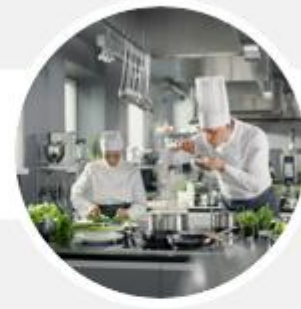
Foodservice Convenience Stores and other small format Businesses