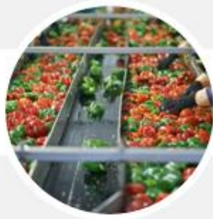
Protein and Dairy Processors