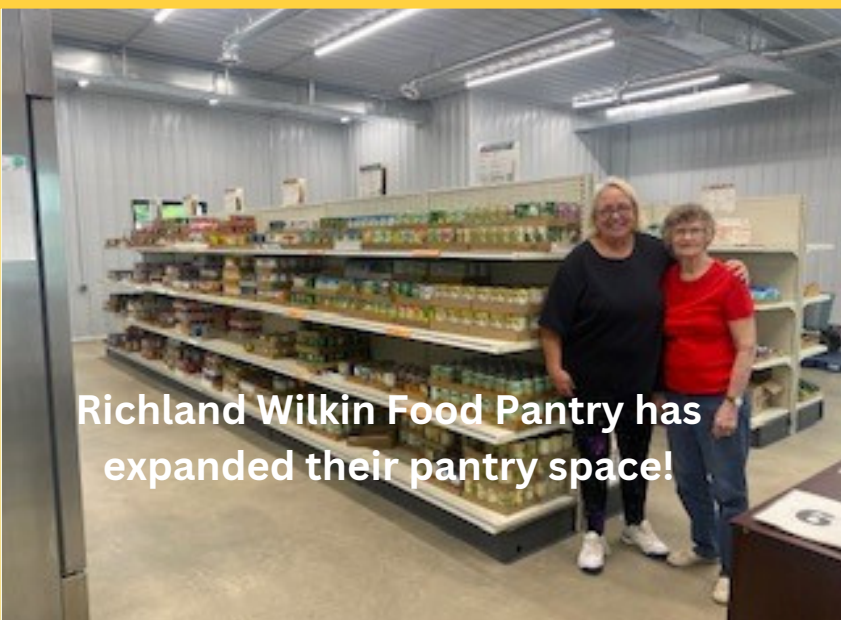
Richland Wilkin Food Pantry has expanded their pantry space!